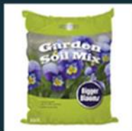
X Mulch or Soil Bags