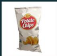
X Chip Bags