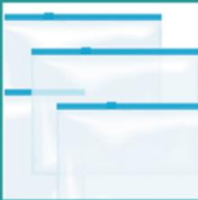
Resealable Food Storage Bags