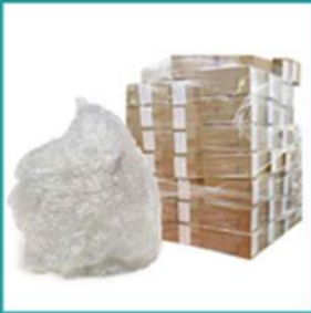
Pallet Wrap and Stretch Film