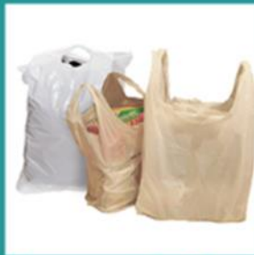
Grocery and Retail Bags