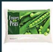
X Frozen Food Bags