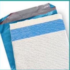
Plastic Only Shipping Envelopes & Bubble Mailers