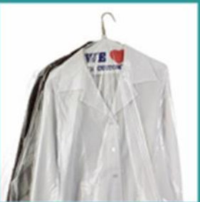
Dry Cleaning Bags