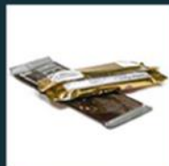
X Candy Wrappers