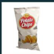
✗ Chip Bags