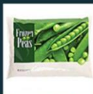
✗ Frozen Food Bags