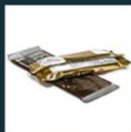
✗ Candy Wrappers