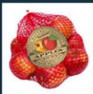
✗ Net or Mesh Produce Bags