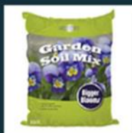
✗ Mulch or Soil Bags